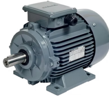
ELEKTRİKLİ MOTOR MOTOR المحرك