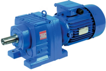
REDÜKTÖRLÜ MOTOR MOTOR GEARBOX علبة تروس المحرك