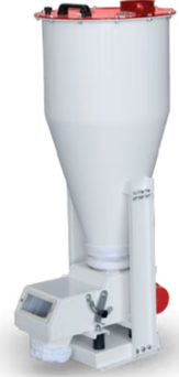
VİBRO TAKATUKA VIBRO FEEDER فيبرو الطاعم