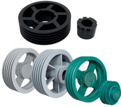
V KASNAKLARI V-PULLEY الخامس بكرة